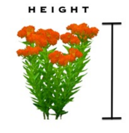
Height: 2 to 4 feet. 1 foot is common for first year growth.